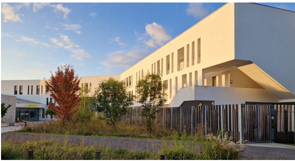
CY Advanced Studies