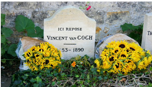
Van Gogh resting place