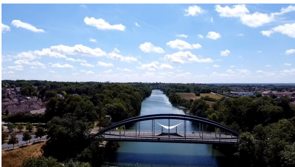
Bridge in Neuville-sur-Oise (15 minutes walk from CYAS)