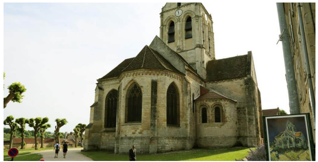
Church in Auvers-sur-Oise