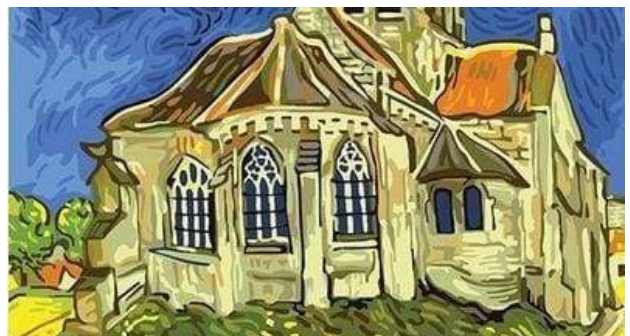
Van Gogh painting of the above church